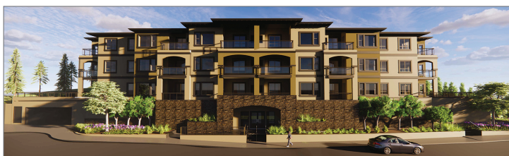
* Exterior building colour subject to change.